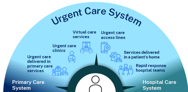
Note: This graphic is not to scale and emphasises the Urgent Care System for communication purposes

The NSW Government is to deliver 25 Urgent Care Services (UCS) across NSW in the next three years. The Services will offer new options for people when their care needs are urgent, and non life threatening.