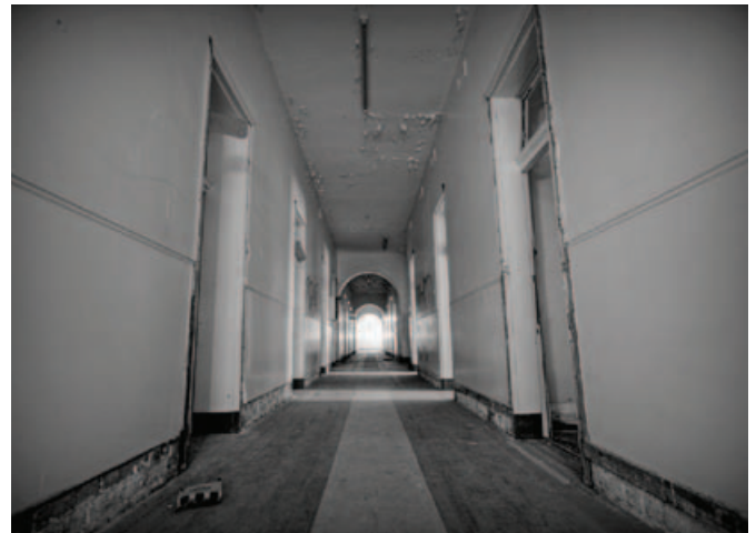
Abandoned Hospital, WA

Common challenges of the workplace such as decision making, accepting risk, responsibility and conflict, when experienced in a supportive work environment, enabled consumers to develop coping mechanisms for the transition into living and working in the wider community.