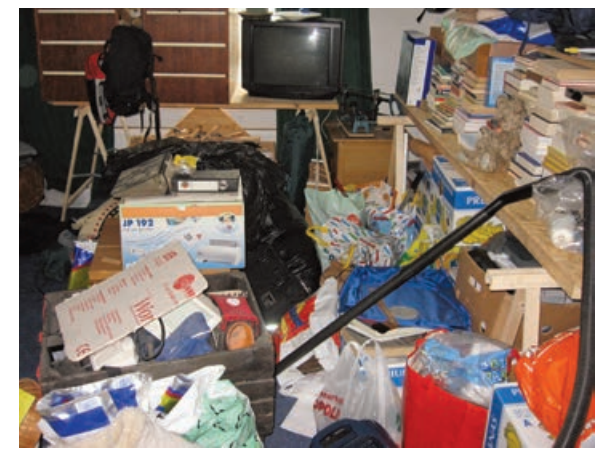
The report identified a clear need for close cooperation between contacting agencies

The challenge laid out from the 2011 conference was that primarily the issue of hoarding and squalor is seen as "no-one's problem" – making it everyone's problem. International literature has for some time pointed toward the need for coordination, collaboration and joined up service responses. In terms of government response, there isn't clear evidence on whether there is a need for specialised hoarding and squalor services in every region, however where they don't exist the report identified a clear need for close cooperation between contacting agencies.