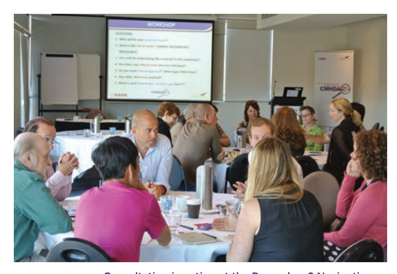
Consultation in action at the December 2 Navigating Research Ethics forum